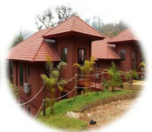
Stay at our lodge